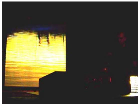
Live at Elysium club 2004 in Austin, USA