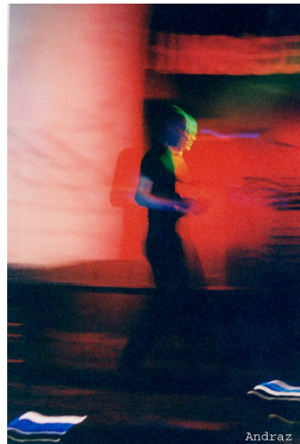
Live at Red Rose 2003 in London UK