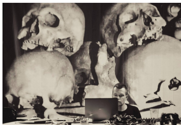
Live at The Valhalla Festival, Norrköping, Sweden.