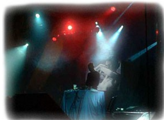
Live at the Eurorock Festival 2000 in Belgium.