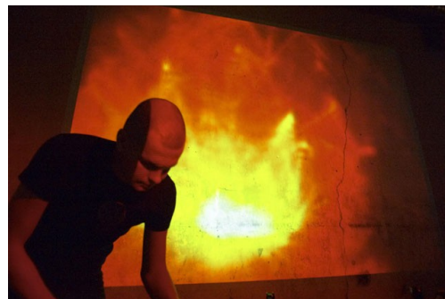
Live at Basement 2004 in Denmark