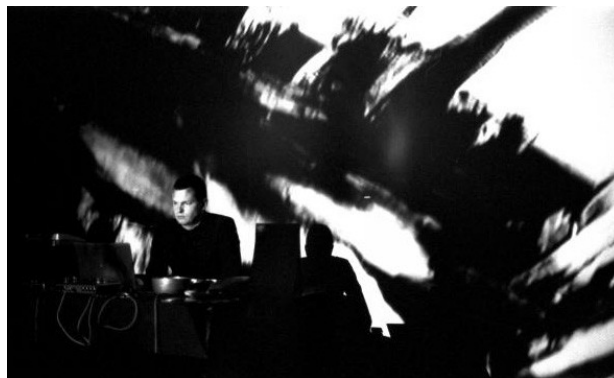
Live at the DOM Club 2010, Moscow, Russia.