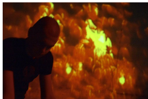
Live at Basement 2004 in Denmark