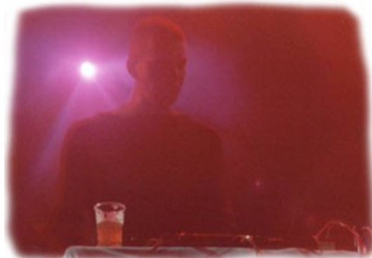
Live at the Eurorock Festival 2000 in Belgium.