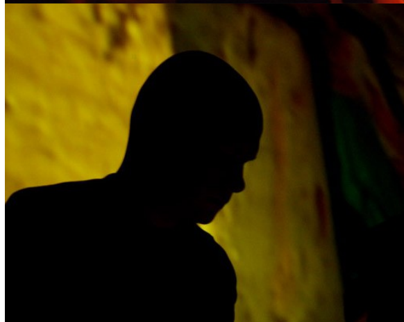
Live at CC Luchtbal, Antwerpen, Belgium