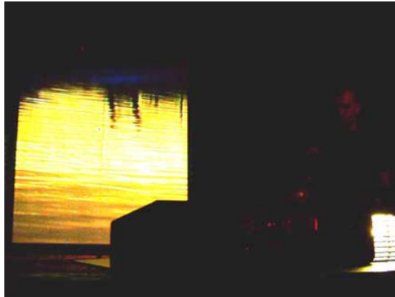
Live at Elysium club 2004 in Austin, USA