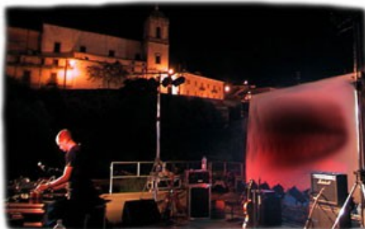
Live at the Festival Invasioni 2001 in Italy.