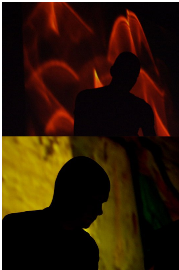
Live at CC Luchtbal, Antwerpen, Belgium