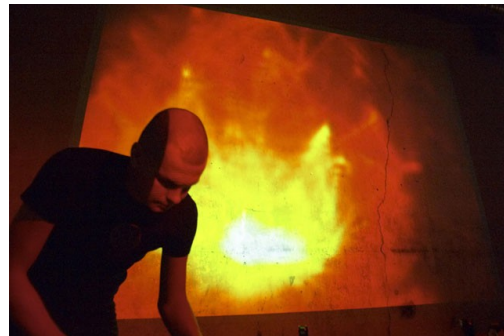
Live at Basement 2004 in Denmark